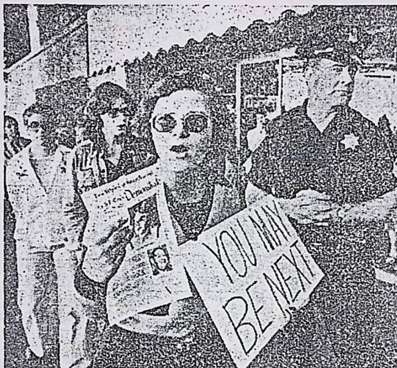
Women marched and chanted outside the Hilton Hotel