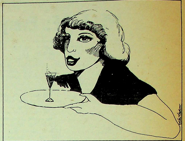
(Branching Out July-August 1977)

For more information contact: Black Women for Wages for Housework c/o Brown 100 Boerum Place Brooklyn, New York 11201 Tel. (212) 834-0992