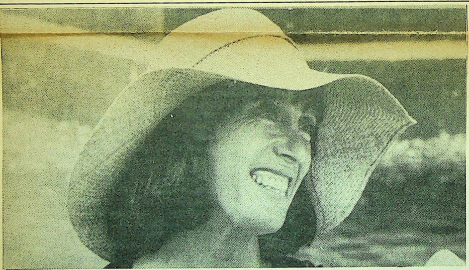
"Every little girl learns by the time she's five how to put the hustle on her Daddy for a new toy."