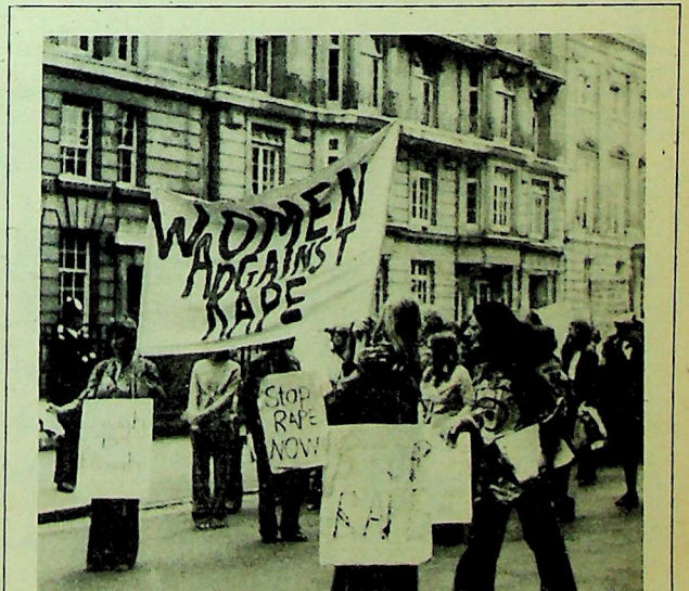
Hundreds of women join march led by Women Against Rape, London, England, July 16, 1977.

The powerful two-hour trial found Government and industry guilty of "conspiracy to rape and perpetuate violence against women in all its forms". Canadian women salute our sisters in Britain with a National Day of Protest Against Rape on Nov. 5!