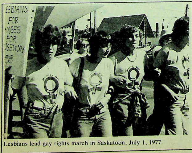
Lesbians lead gay rights march in Saskatoon, July 1, 1977.