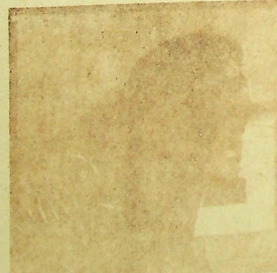
VINCENNES, FRANCE-Selma James, co-author of the feminist classic The Power of Women and the Subversion of the Community, at the Socialist feminist conference, June 1977.