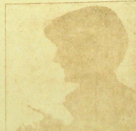
LOS ANGELES, CALIF.-Speaker at the Women's National Conference, Houston, Texas, December 1977.